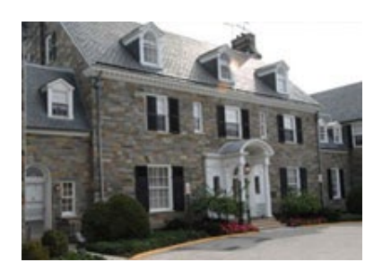
Orientation July 31, 2024 NIH Campus - Building 16: Lawton Chiles International House (Stone House)