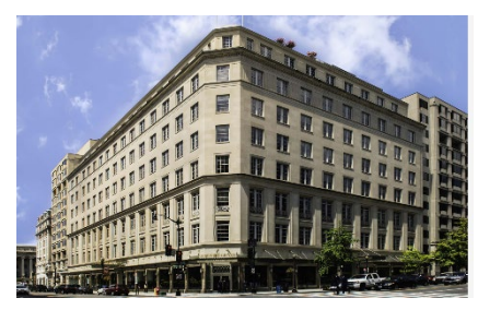
Session 5: Commitment to Public Service February 26-27, 2025 (2 days) Partnership for Public Service (Washington, DC)