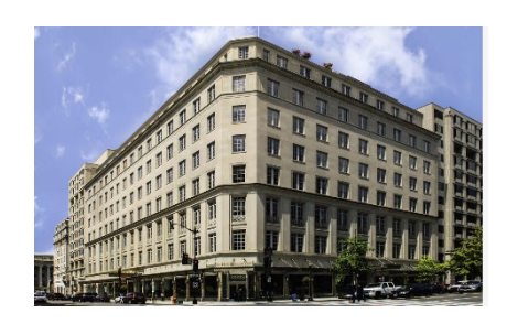
Session 3: Leading Amidst Uncertainty November 20-21, 2024 (2 days) Partnership for Public Service (Washington, DC)