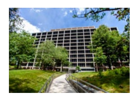
Graduation March 27, 2025 (1/2 day) NIH Campus - Building 31