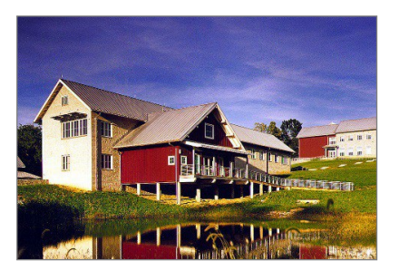
Session 1: Leadership and Self-Awareness September 3-6, 2024 National Conservation Training Center Shepherdstown, WV